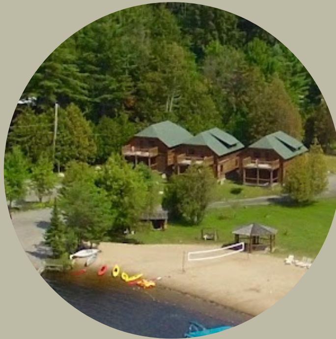
Oak & Beech