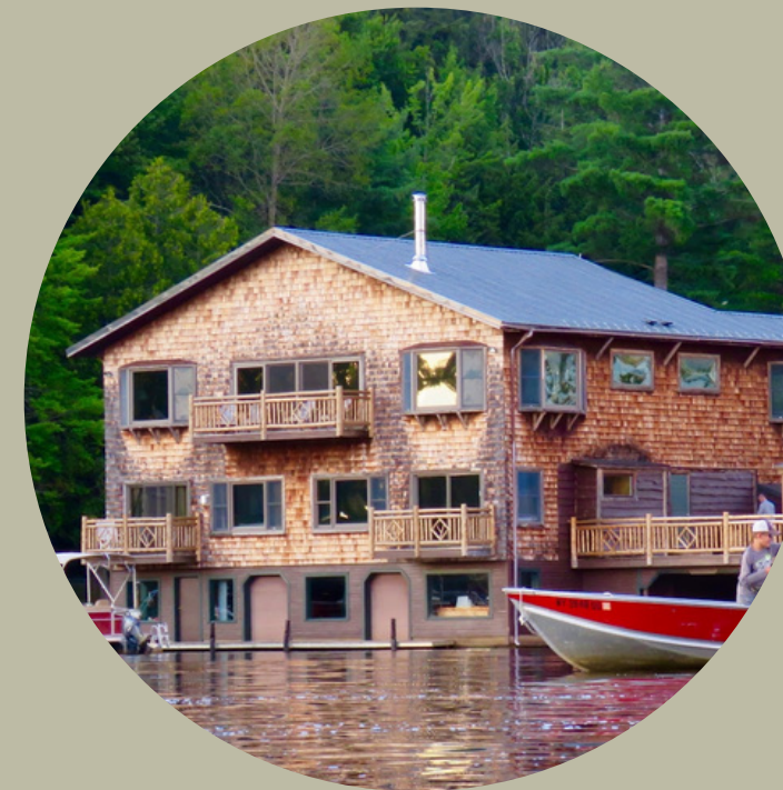
Saranac Lakefront Suite